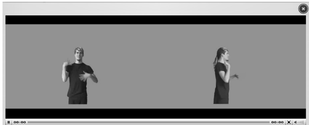
Fig. 5 Screenshot of the video preview of a sign, showing the front and side views

option, which displays a list of all the available fields and lets the user select which ones should be displayed (see Fig. 6). This provides much greater control over the visual display of the results and allows the user to focus on the specific categories that are of interest.