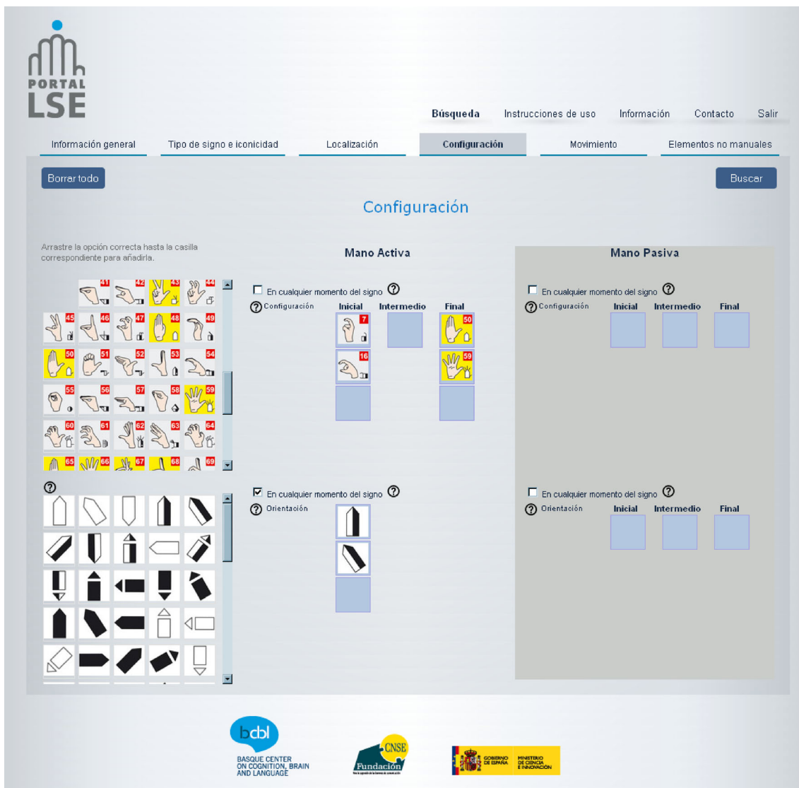
Fig. 2 Screenshot of the Handshape tab of the search tool, showing the selection of various values for the handshape of the dominant hand, and the use of the “At any moment in the sign” option for searching for orientation values regardless of position

material in psycholinguistic experiments, we included information that is relevant from a phonological point of view and also from an articulatory/perceptual perspective, as an experimenter may wish to take into account any combination of these considerations when devising stimulus sets.