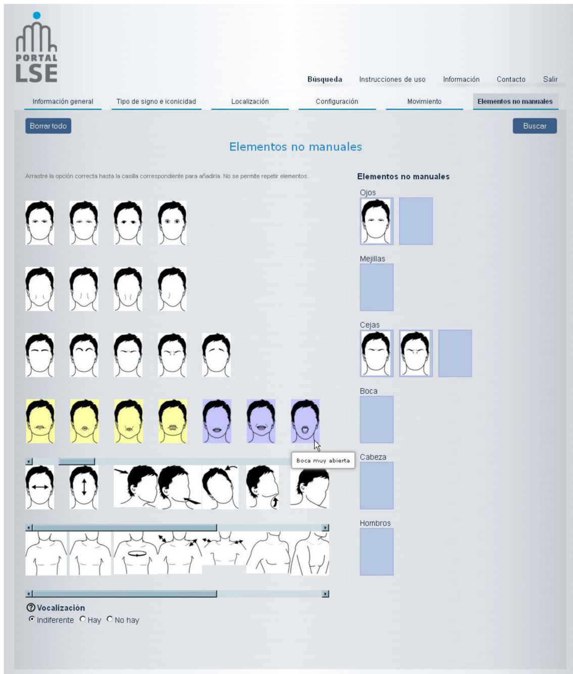
Fig. 3 Screenshot of the Non-manuals tab of the search tool, showing the selection of various values for different fields and the use of the popup cursor tip to view a written label for one of the values of the Mouth field

As mentioned in the description of the encoding process, an initial test of inter-coder reliability on a small sample of signs